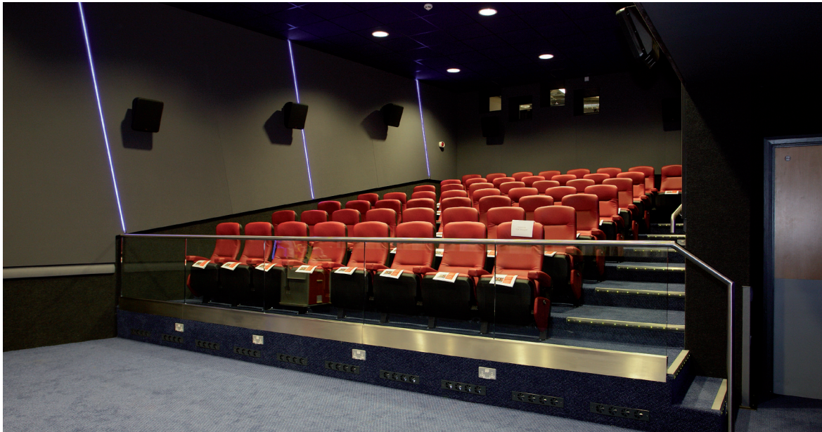
Decorflex & RNT718L Interlok Advance Step Lighting

PROJECT: MEDICINEMA, ROYAL VICTORIA INFIRMARY, NEWCASTLE